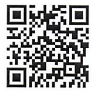
12 yrs & older